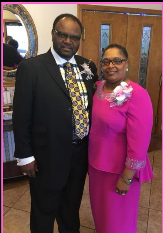
Pastor and First Lady Garner on Pre-Anniversary Day

Children Department – $147.73 Youth Department – $112.10 Young Adult Department – $658.00 Adult Department – $1,333.00 Yearly Offering – $6,337.25